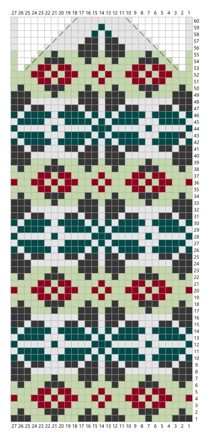
Chart A - Hibernus Mittens