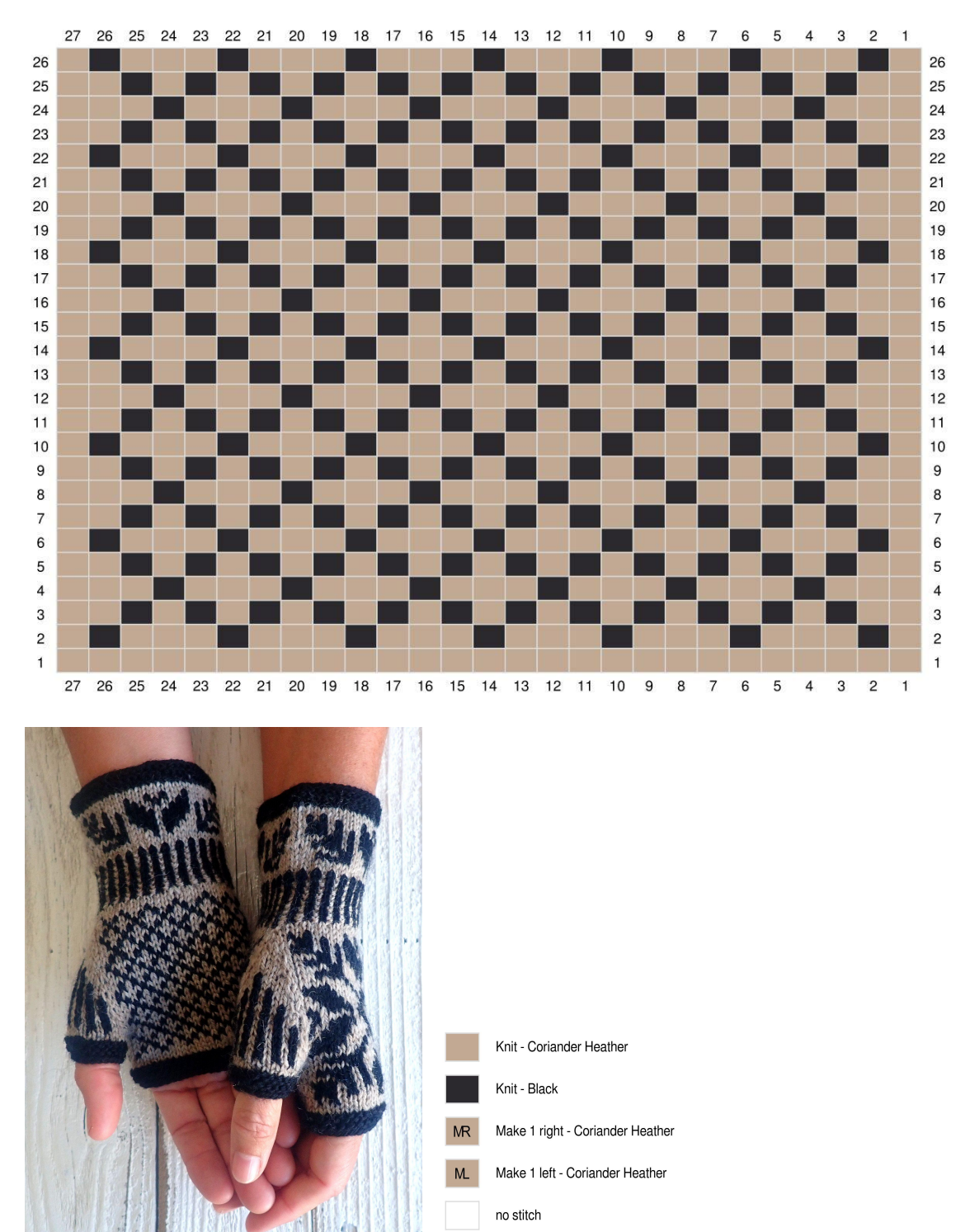
Chart C - Palm - Star Power

View of palm and thumbs of Star Power Mitts